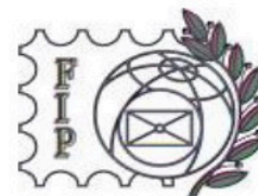
EXHIBIT APPLICATION FORM

Fill in a separate form for each exhibit. Please type or write in BLOCK letters.